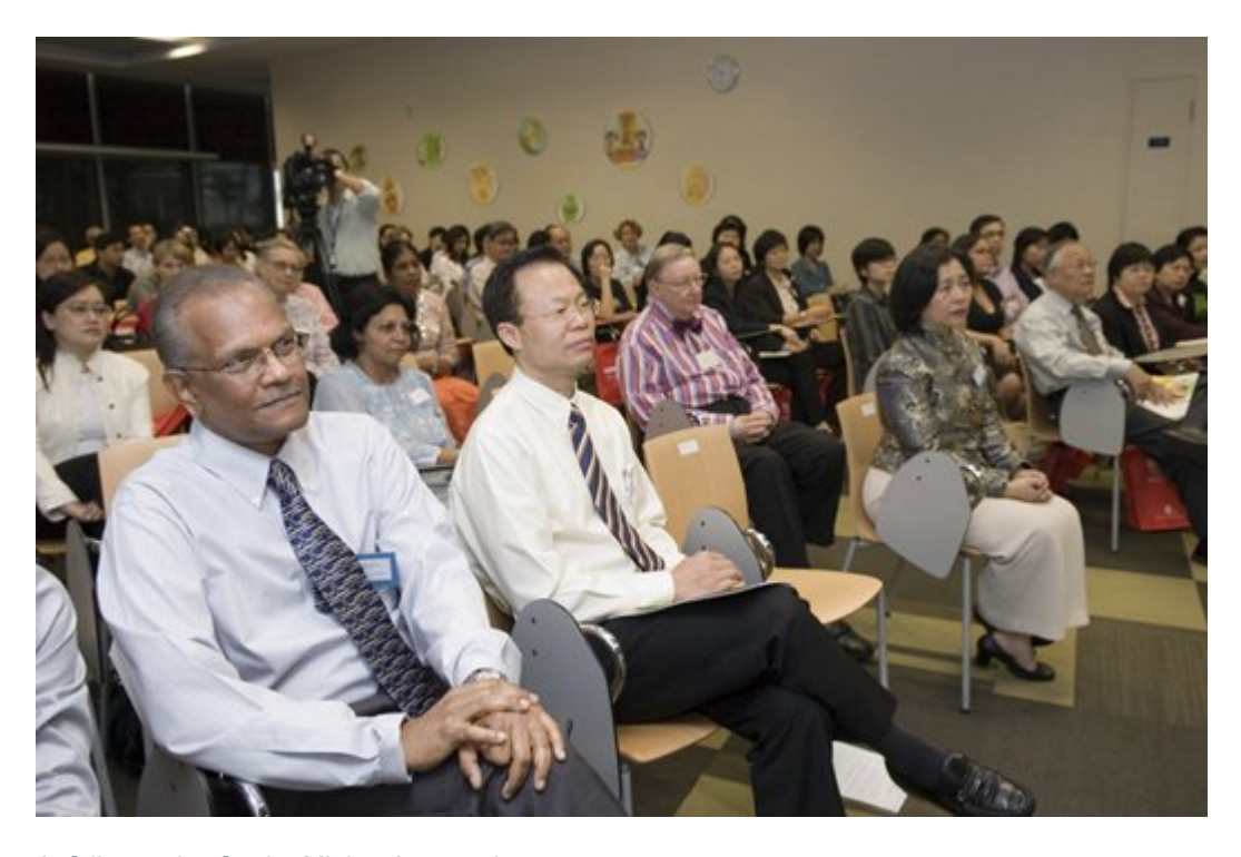
At full attention for the Minister's speech