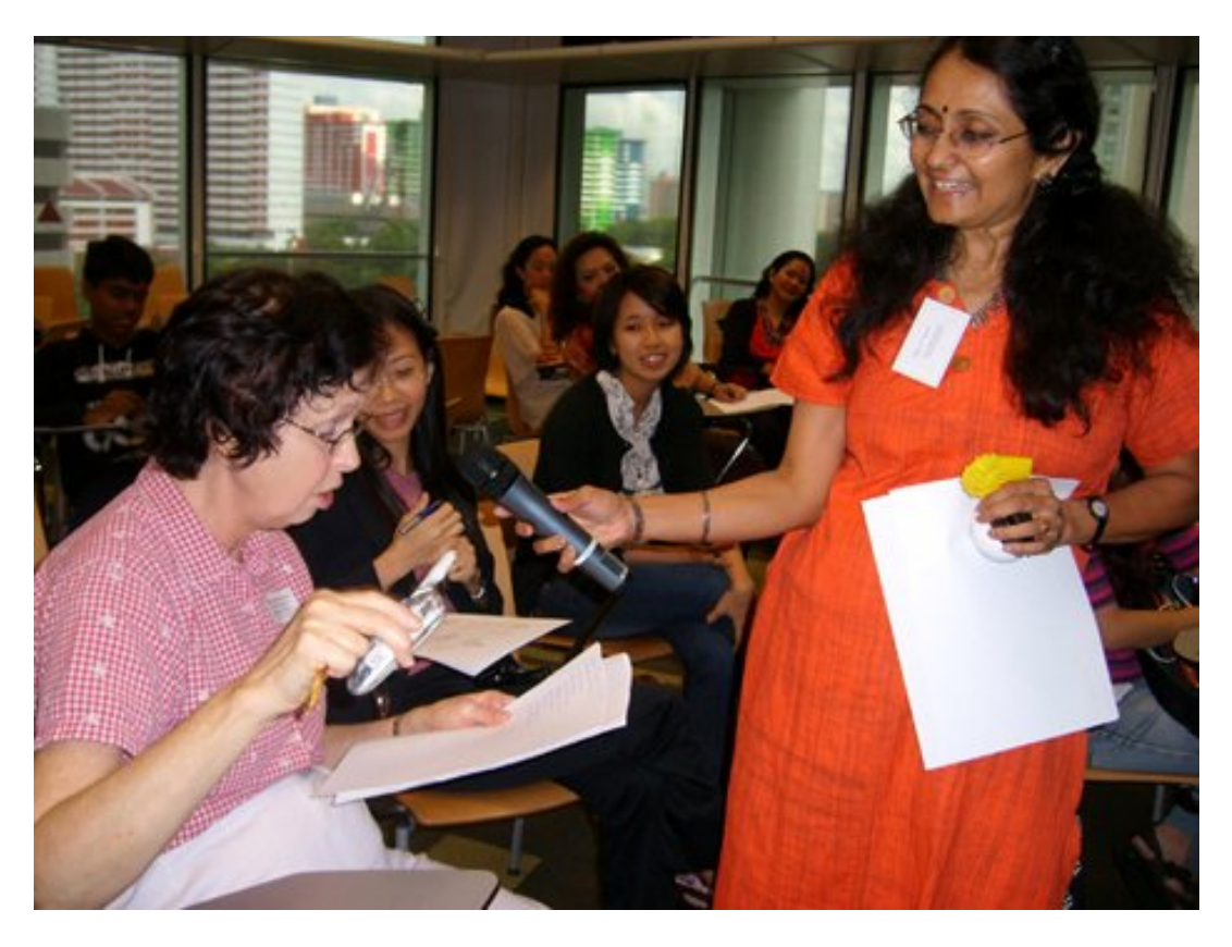
Hands-on & Interactive workshops conducted by acclaimed illustrator Sheila Dhir during the Asian Children's Writers & Illustrators Conference