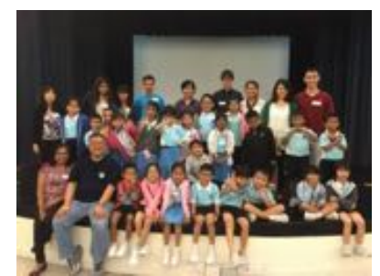
The students from Batch 1 of the Let's Read Together Programme

The first session was held at Geylang East Public Library in Feb 2015, and the second session at Jurong West Public Library in Apr 2015. Two more sessions will be conducted in 2015. These programmes were fully sponsored by Premier Corporation.