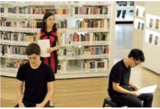
Fringe Activities with School Partners

The target audience of students ages 13 and above were introduced to a wide range of professionals who need to use writing in their everyday work, such as authors, poets, graphic novelists, and journalists, among others. All In! 2015 also featured radio broadcasters and social media mavens to draw the attention of the students.