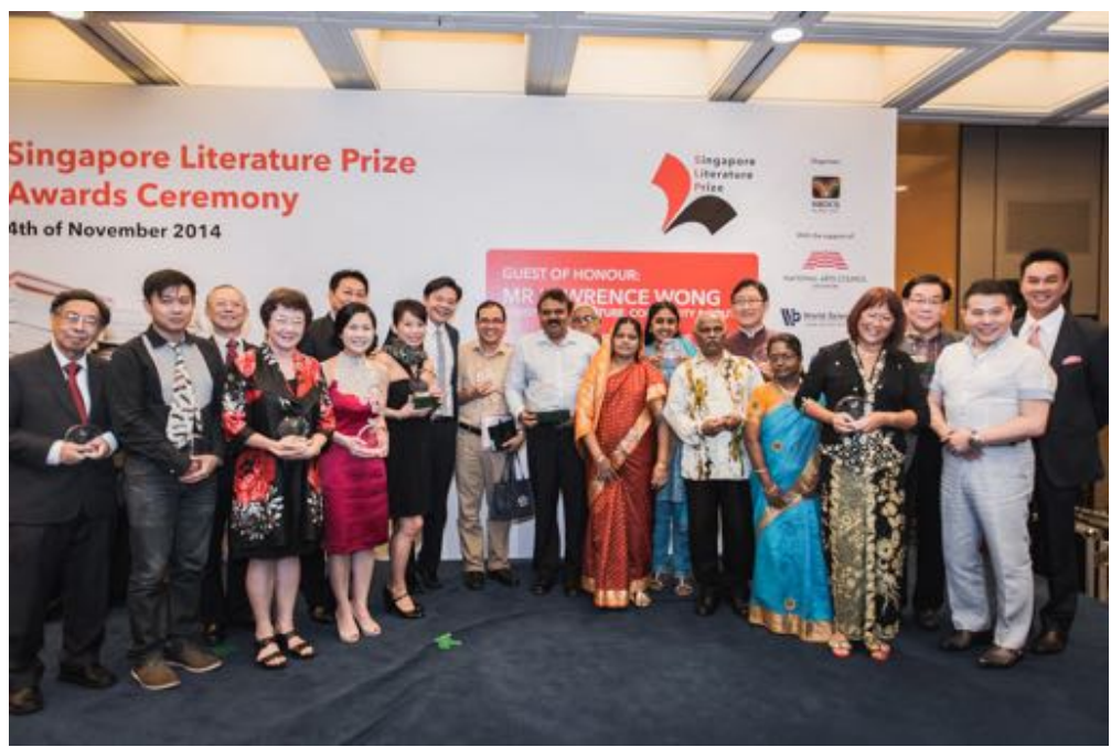
Singapore Literature Prize 2014 winners and sponsors with Minister for Culture, Community and Youth, Lawrence Wong.

There was also a marked upswing in the public profile of the Council both in Singapore and Asia, particularly in the area of awards. The Singapore Literature Prize was boosted significantly with the creation of new categories, and the Scholastic and Samsung awards also received more encouraging responses from writers and publishers from across Asia. The AFCC was widely written about in online blogs and in the social media, as well as receiving coverage in the mainstream media. For the first time, several articles on AFCC, its programmes and speakers were featured in the Thai press.