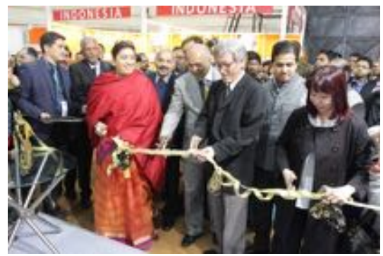
Opening Ceremony of the Singapore Pavilion at NDWBF 2015

As part of the programme of activities, the High Commissioner of Singapore to India graciously hosted an evening reception for the delegation.