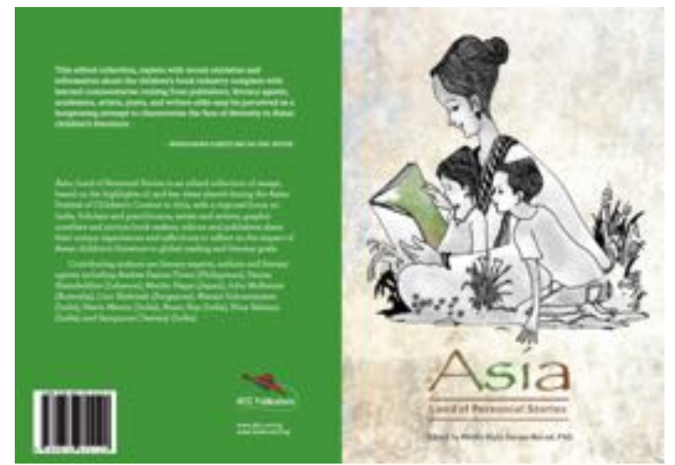
The book features 10 chapters of presentations and papers from AFCC 2014

The Council published a compilation of interviews and articles based on papers that were presented at AFCC 2014, edited by Dr Myra Garces-Bascal. This is a continuing series, following the first two books: Beyond Folktales, Myths and Legends (2013) and One Big Story (2014).