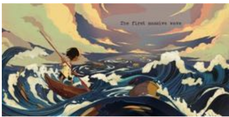
The First Journey Winner, SPBA 2015 (Vietnam)