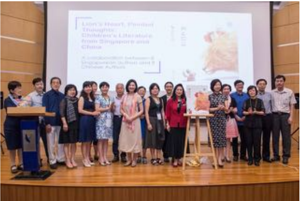
The anthology featured stories from both Singaporean and Chinese authors, with illustrations by Chinese artists.

Lion's Heart, Painted Thoughts was a joint project between the Council and Hunan Juvenile & Children's Publishing House from China. The book is a bilingual collection of 16 illustrated stories from 8 Chinese authors and 8 Singaporean authors. The book was launched at AFCC 2015.