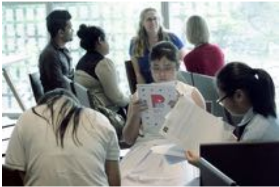
Workshops and Masterclasses

A total of 220 delegates registered for this year's Festival. Students were able to tap on the NAC's Art Education Programme (AEP) subsidy to purchase tickets. Day One offered a series of panel discussions and seminars, having a total of 11 sessions featuring 21 speakers, while Day Two offered 5 intensive workshops.