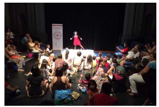
Interactive Session with Audiences