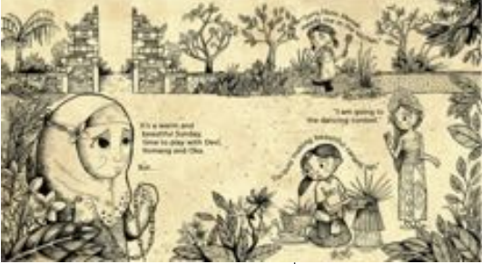
Panduh, the Ogoh-Ogoh Maker 1<sup>st</sup> Runner-up, SPBA (Indonesia)