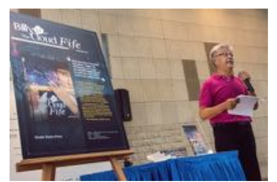
Book and Product Launches

In addition, another 10,000 participants attended the Media Mart and Book Fair, 19 book and product launches, 7 special programmes and 4 award presentations.