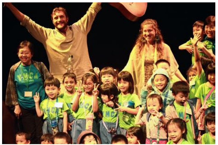
Children's programming and community outreach