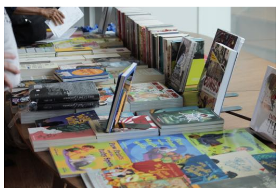
The featured authors' works were sold at the Festival bookstore