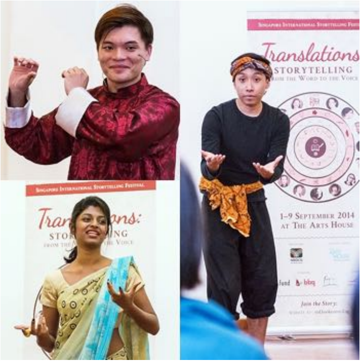
Performances in the mother tongue languages

To further explore the use of multiple languages in storytelling, the Council organised storytelling in tandem in English and Korean as part of the public performances in the 2015 Asian Festival of Children's Content.