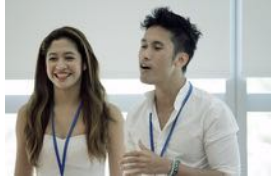
Celebrities and Interactive Segments