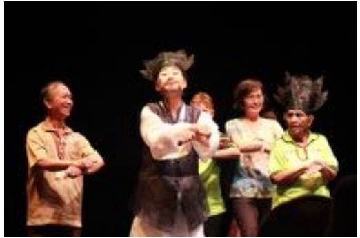
Korean Pansori performance

SISF 2014 was held from 1-9 September and focused on the various techniques and styles of sharing oral stories through careful and considered translation. Some of the forms showcased included the narrative verses of Dastaan from the Indian subcontinent, musical Pansori storytelling from Korea, the three mother tongue languages of Singapore (Malay, Tamil and Chinese), as well as the importance of translating and re-telling the literary works of eminent local authors.