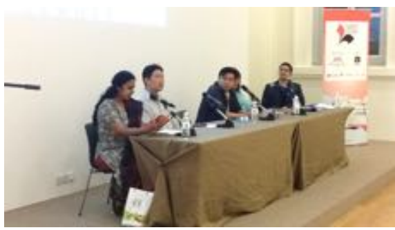
Meet the SLP Winners at Singapore Writers Festival